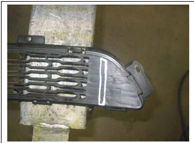
Figure 5: Grille marked for cut