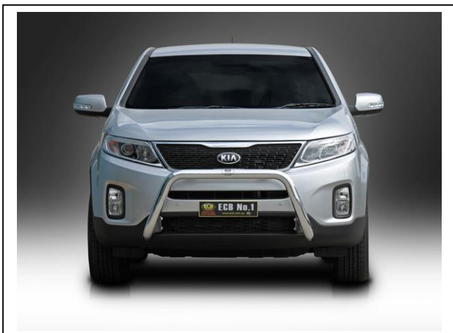
Figure 7: Front view