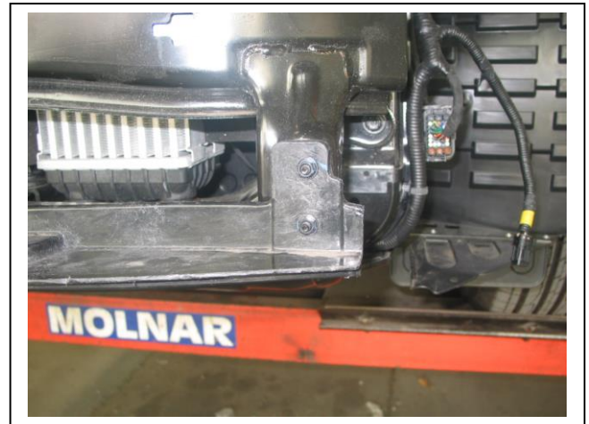
Figure 2: Remove lower bumper support, two 10mm bolts per side.