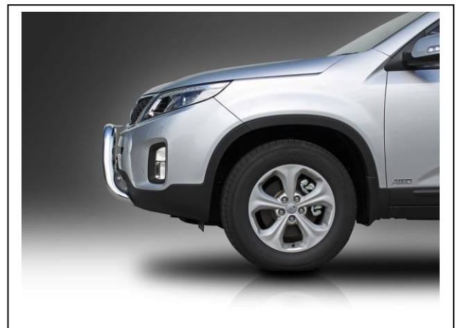
Figure 8: Side view