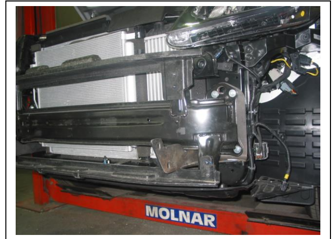
Figure 4: Steel mount fitted to vehicle.