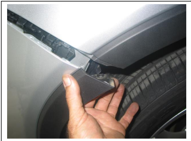
Figure 1: Pull rear of plastic bumper out from vehicle to release clips.